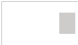
Featured Rectangle (263 x 330)

URL required. All ads due 2 weeks prior to posting.