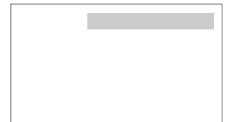
Leaderboard (728 x 90)